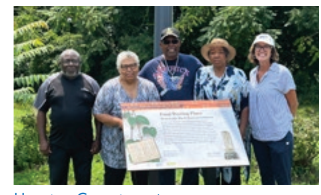
Houston Cemetery sign