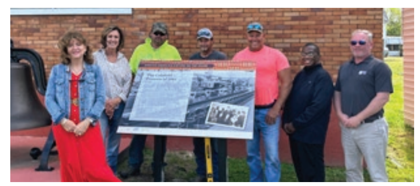
Crisfield Protests of 1961 sign

You can listen to them at beachesbayswaterways.org.