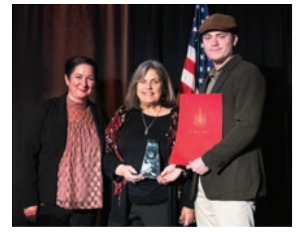
BBHA won the Environmental Service Award from the Salisbury Area Chamber of Commerce.