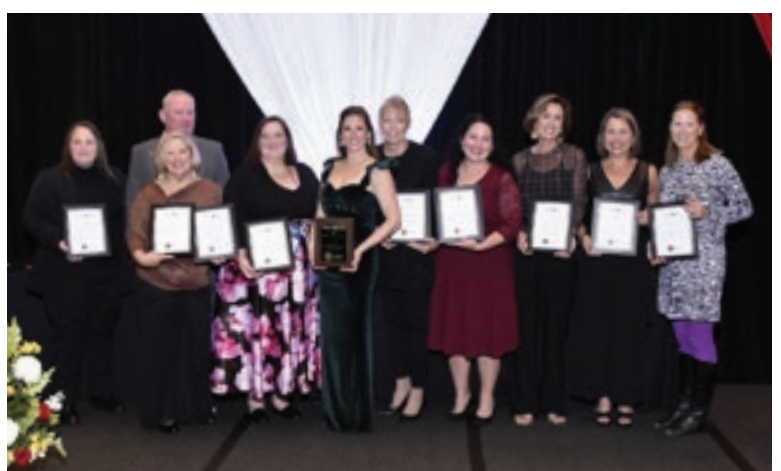
BBHA shared in the Partnership Award for Chesapeake Country All-American Road initiatives from the Maryland Tourism Coalition.