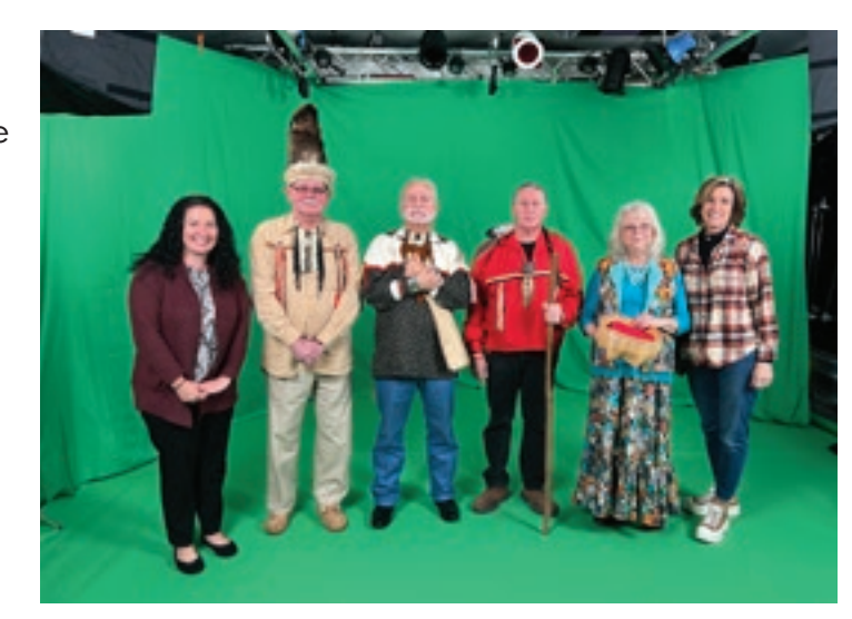
Filming for Accohannock Indian Tribe Holotwin

Working with Unscene Productions and RealityBLU, which creates holotwins through its WorldViewAR platform, BBHA developed three holotwins for use in the heritage area: Tindley Choir, Accohannock Indian Tribe clan leaders, and a broom maker at Furnace Town. Holotwins, or "holographic twins," are digital "twins" of people, animations, or even videos superimposed over the viewer's real-world environment as seen through their cellphone screens. To see the holotwin, the viewer scans a QR Code or clicks on a link in a text message, answers a few prompts, and the image of the person or thing pops up in their screen and starts speaking as if they were right in the room with them. Holotwins are as close to in-person as you can get without a full holographic image. This is a new tool for telling the stories of the heritage area, offering a more engaging experience for those who come to visit.