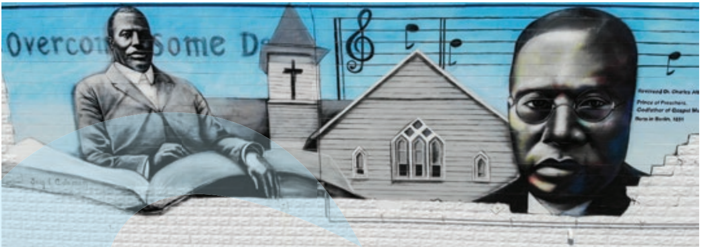
Charles Tindley Mural

BBHA partnered with the Town of Berlin on the Charles Albert Tindley Mural and received a façade grant of $10,000.