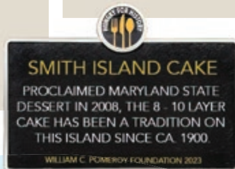
Mockup of new sign

The BBHA has also partnered with the Rural Maryland Council, Preservation Maryland and Choptank Communications to host an Electric Vehicle Summit in February 2023. The prime goal is to increase equity and accessibility of historical, cultural and recreational destinations, along a network of scenic byways.