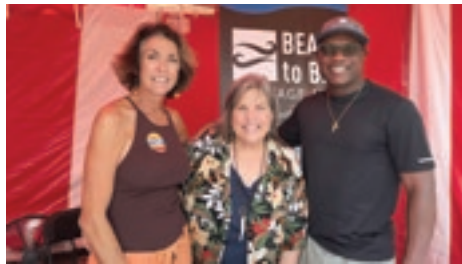
National Folk Festival

MAY: Bay Day, Ocean Pines • Ribbon cutting, Ag Exhibit at Tawes Museum, Crisfield • Nabb Center Fundraiser, Berlin