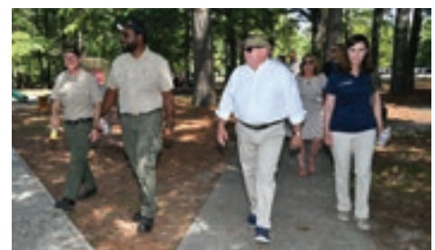
Pocomoke State Park Trail Ribbon Cutting