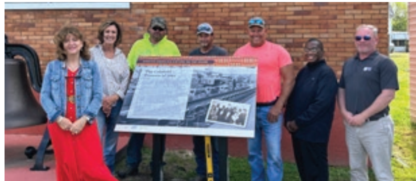
Crisfield Protests of 1961 sign