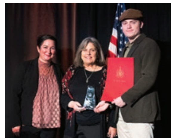
BBHA won the Environmental Service Award from the Salisbury Area Chamber of Commerce.