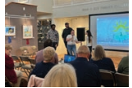
Art League event