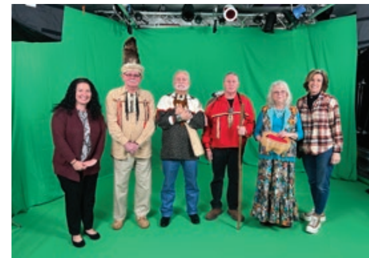
Filming for Accohannock Indian Tribe Holotwin

Working with Unscene Productions and RealityBLU, which creates holotwins through its WorldViewAR platform, BBHA developed three holotwins for use in the heritage area: Tindley Choir, Accohannock Indian Tribe clan leaders, and a broom maker at Furnace Town. Holotwins, or “holographic twins,” are digital “twins” of people, animations, or even videos superimposed over the viewer’s real-world environment as seen through their cellphone screens. To see the holotwin, the viewer scans a QR Code or clicks on a link in a text message, answers a few prompts, and the image of the person or thing pops up in their screen and starts speaking as if they were right in the room with them. Holotwins are as close to in-person as you can get without a full holographic image. This is a new tool for telling the stories of the heritage area, offering a more engaging experience for those who come to visit.