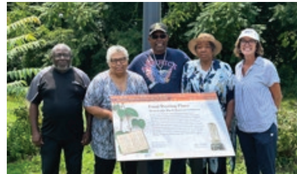
Houston Cemetery sign