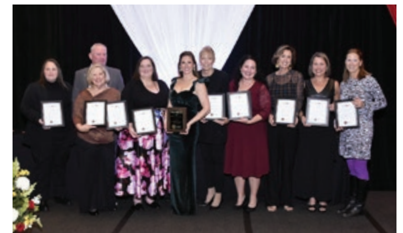
BBHA shared in the Partnership Award for Chesapeake Country All-American Road initiatives from the Maryland Tourism Coalition.