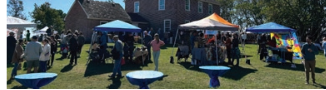
Rackliffe House Colonial Harvest Festival