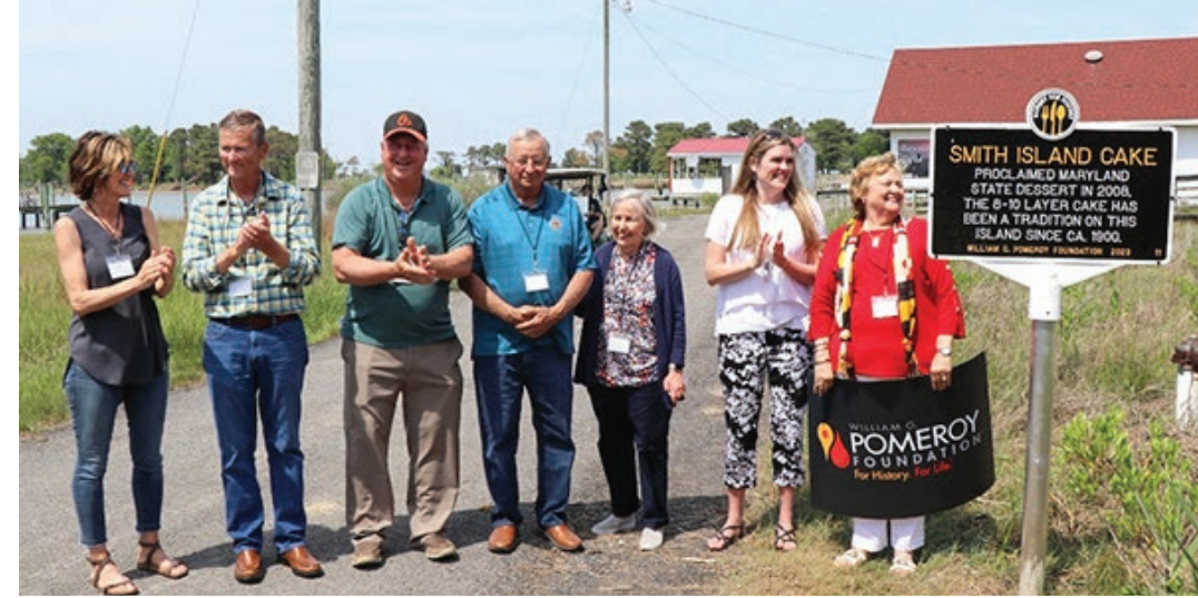
Dedication of the Smith Island Cake sign in Ewell.

Beach to Bay Heritage Area received a mini-grant to purchase laptops and printers to loan to small heritage-based nonprofits lacking the resources to accomplish their day-to-day mission. The BBHA will serve as a repository for this equipment, which will hopefully level the playing field when these smaller organizations are applying for and managing grants. The first organization to take advantage of this new loaner program is the Mt. Zion Historical Society.